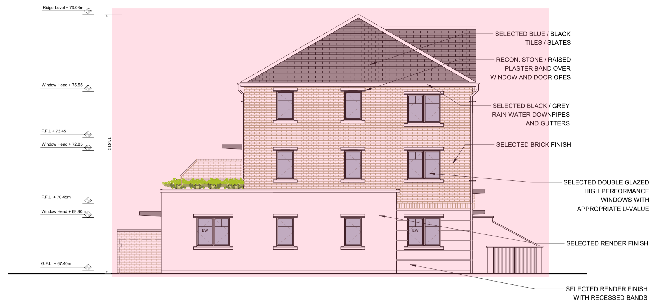
SOUTH ELEVATION - BLOCK I